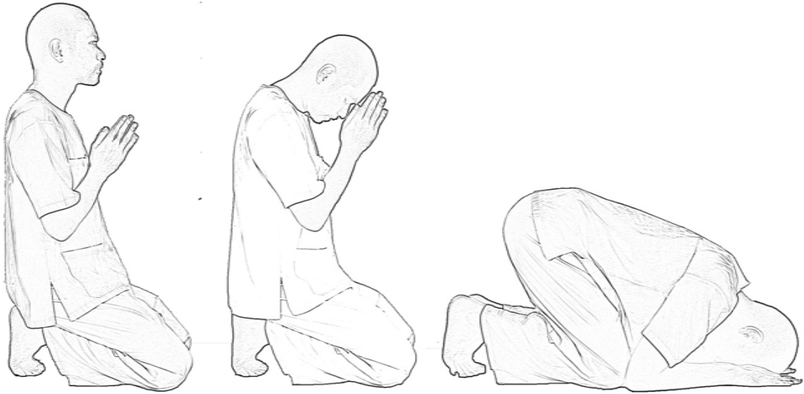
Figure 1 : Five Point Prostration – (from left to right - Añjali, Vanda and Abhivāda)